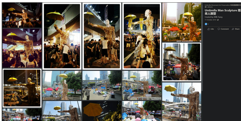
Figure 1 The photographs of the Umbrella Man sculpture documented by Kacey Wong in ‘Umbrella Movement Art Preservation’

freedom of collecting for gaining public trust. 6 In 2016, Tina Pang, who was the curator of Hong Kong Visual Culture , claimed that as the movement’s objects represented the political awakening of an entire generation of young people, the museum had a plan to acquire some from the movement, regardless of the arguments about whether a government-funded institution would collect objects with anti-government messages or not. 7