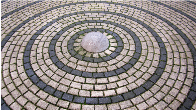
Figure 2 Vlugt, Harald, “Centre Spot”, concrete, 2002, Esplanade de Meer near no. 68, Amsterdam.

gible object, collected for its intangible aspects, were placed in the Ajax Museum and supporters were invited to participate? However, football museums, partners in the Football Makes History project, are not neutral places and have their own knowledge repertoires and use their own language. Furthermore, the Keti Koti Table, starting already from the viewpoint of the slavery past, might also not be suited to discuss the tension between commemorators of that past and commemorators of the Shoah.